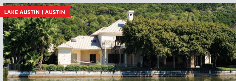
LAKE AUSTIN | AUSTIN

"Austin embraces different cultures and languages and music and food, but you still sort of have that Southern charm you get from being in Texas," Decker says. "I love those perfect marriages in a place like this." THR