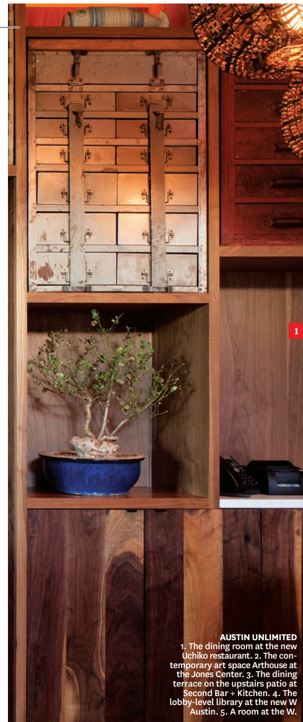
AUSTIN UNLIMITED 1. The dining room at the new Uchiko restaurant. 2. The contemporary art space Arthouse at the Jones Center. 3. The dining terrace on the upstairs patio at Second Bar + Kitchen. 4. The lobby-level library at the new W Austin. 5. A room at the W.