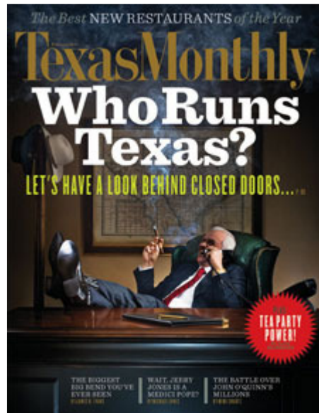
Who runs Texas? Houston restaurants!

In "Where To Eat Now 2011," Sharpe points out that one of the defining food trends for the last year and into this new one has been comfort food. And although the three restaurants named all feature very different interpretations of this style -- Haven with rustic Gulf Coast dining, Branch Water Tavern with cocky New American and Stella Sola with an